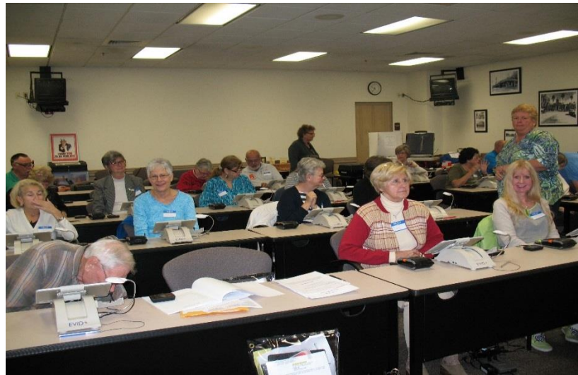
New Poll Worker training class