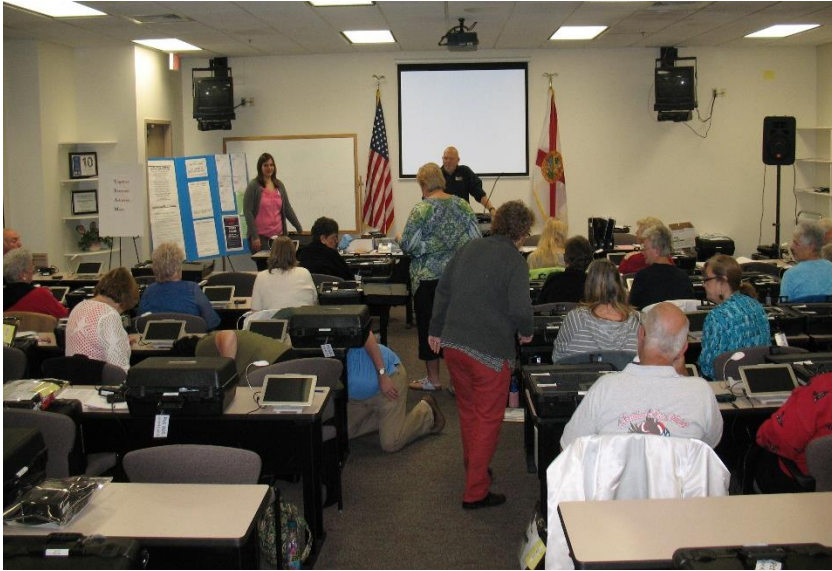
Training on the new electronic poll books, called EViD Slates

Election workers unpacking the electronic poll books (electronic voter identification) EViD.