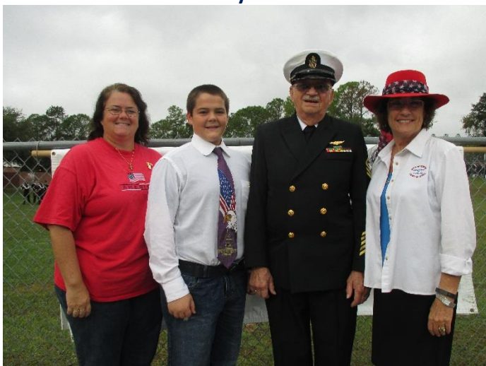
2015 Veterans Day Parade in Inverness