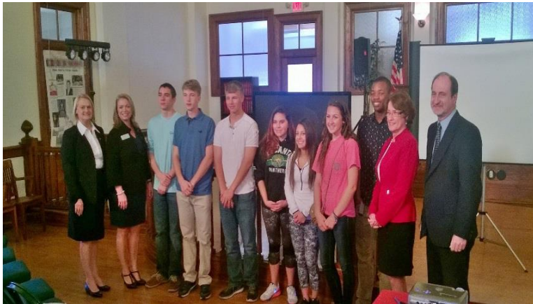
Youth Leadership Citrus Class of 2016 Government Day